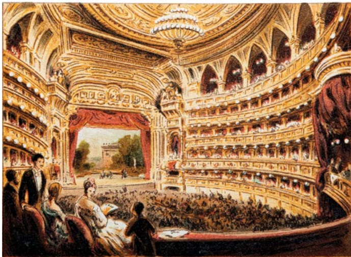
Illustration of a Vienna Court Opera (Wiener Hofoper), Giovanni Varrone Court Opera.

2 Thursdays Dec. 4 & 11 10:30 a.m.-noon 252SNR306 $40 Hybrid