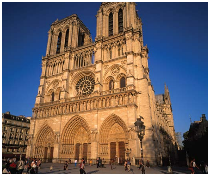
Notre Dame de Paris Cathedral.

4 Thursdays Sept. 25-Oct. 16 10:30 a.m.-noon 252SNR303 $65 Zoom