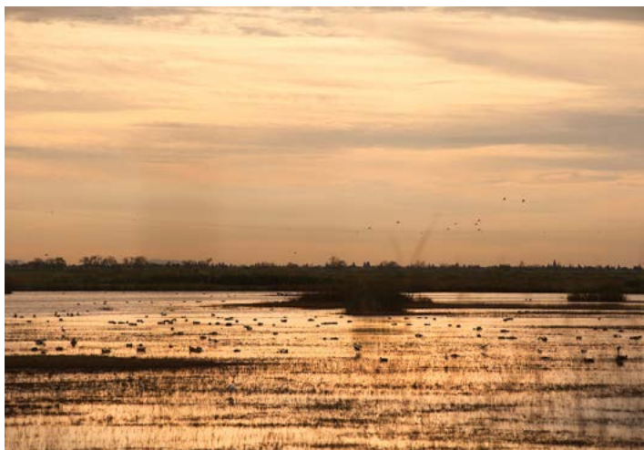
Water fowl populate the Yolo Bypass Wildlife Area.

1 Thursday Nov. 20 9 a.m.-noon 252SNR909 $35 Car Trip